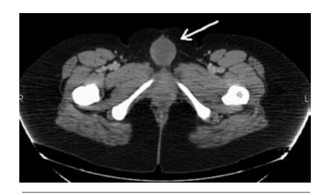
Figure 1. Pelvic CT demonstrating location of mass (arrow).

Low grade fibromyxoid sarcomas are rare lesions that typically develop in the soft tissue of the extremities and trunk. This patient presented with a somewhat unusual location in the mons pubis, and was treated by primary excision. She will require long term follow up, as local recurrences and late metastases are possible.