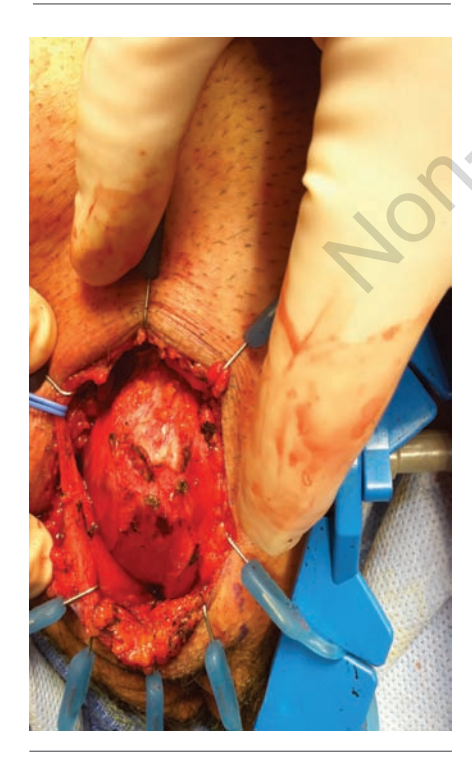
Figure 2. Gross appearance of lesion during excision.