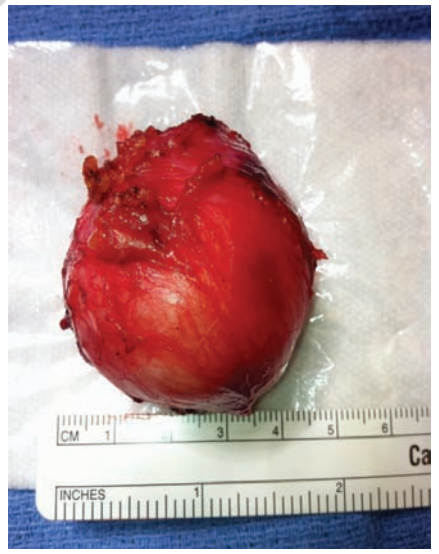
Figure 3. Gross appearance of lesion (note pseudocapsule).

A CT scan (Figure 1), demonstrated a heterogeneous mass, approximately 5 cm in diameter, with an average Hounsfield measurement of 34.47 units. A frozen section biopsy under anesthesia initially suggested an angiomyxoma, and the lesion was removed in it's entirety. Gross examination demonstrated a firm, pseudoencapsulated mass (Figures 2 and 3), which on pathologic evaluation proved to be a low grade fibromyxoid sarcoma (LGFMS) comprised of predominantly spindle-appearing cells (Figures 4 and 5). No mitotic figures were identified, and the pathologic stage was pT1apNx. LGFMS may have a rather bland histologic appearance, and are sometimes difficult to distinguish from other low grade sarcomas and benign mesenchymal tumors unless the characteristic genetic translocation [t(7;16)(q34;p11) or t(11;16)(p11;p11)] is identified. Even such stains as anti-CD34 or vimentin may not be specific enough to clearly identify LGFMS. In this case, strongly positive staining with Mucin 4 transmembrane glycoprotein (MUC 4) and weak staining with epithelial membrane antigen (EMA) confirmed the diagnosis. Positive staining for MUC 4 was recently proposed as a highly specific marker for LGFMS,1 and a high percentage of LGFMS will stain focally with EMA as well. Despite the gross appearance of encapsulation, these lesions have a propensity for local recurrence, and late distant metastases.